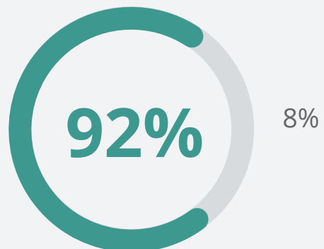
For every R100 you pay

■ Paid back in claims ■ Non-healthcare expenses and solvency